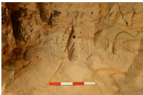
Carvings in the newly revealed cave in St Catherine's Hill