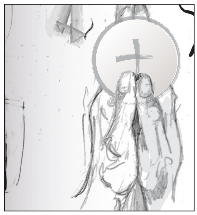
If Confirmation is first and foremost about what God is doing for us and in us and with us and through us, what is needed from us?

We need to be prepared: to expect to receive, to be open to God's calling, to be ready for his embrace, to want to experience his presence and power. We need to want and desire God, to long and thirst for him.